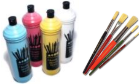
paints and brushes