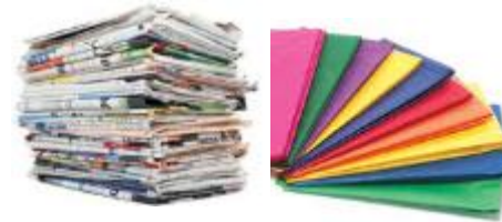
coloured tissue paper / newspaper / shiny paper / cellophane / fabric