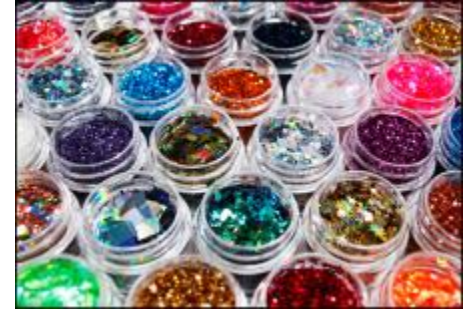
glitter / sequins